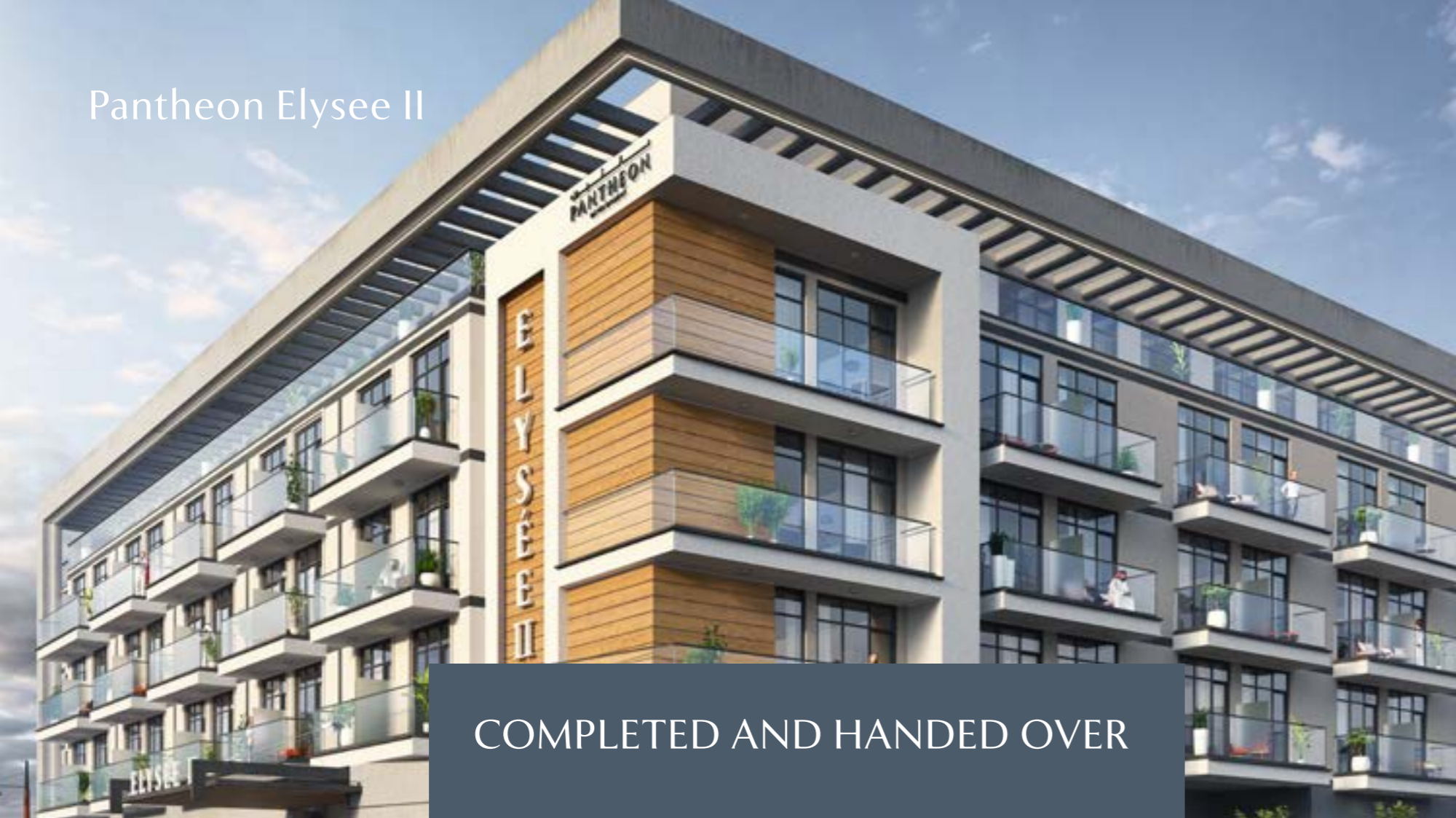
Pantheon Elysee II